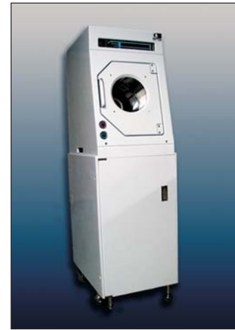
400 Series Roll around

"S" Models come standard with digital controllers. "S" Models come standard with brushless motors and quick disconnect rotors. 4300 bowls require 4-bolt rotors.