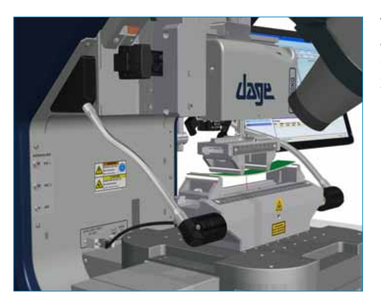
4 Point bend Jig

In addition, the Paragon flexure test software allows bespoke cyclic testing for custom test procedures, user defined cyclic patterns and selectable load range and speeds. Destructive and non-destructive tests are also featured. These custom test features allow for the determination of fail points of components or materials.