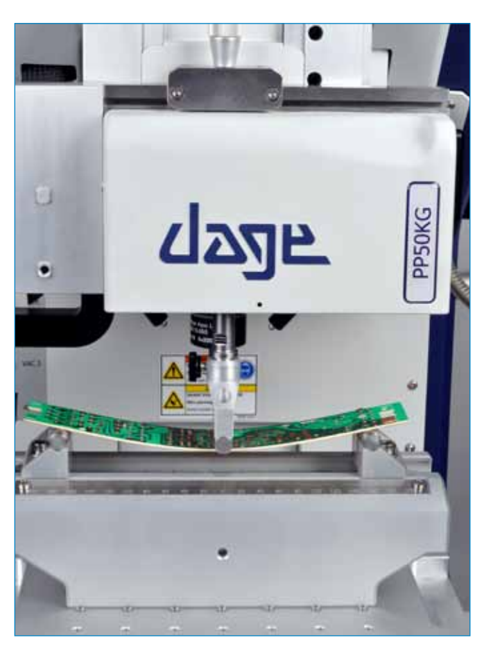
Push/pull 50kg with 3 point bend jig

The 4 point flexure fixture produces peak stresses along an extended region of the specimen hence exposing a larger length of the specimen with more potential for defects and flaws to be highlighted.