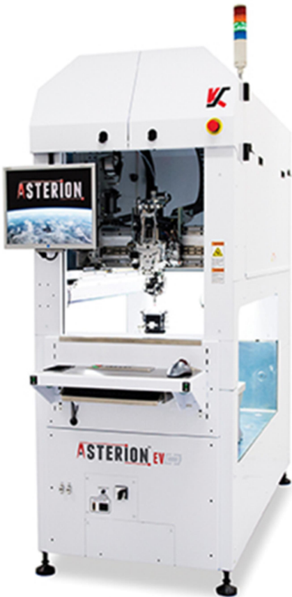
Figure 3: K&S Asterion EV Battery Wire Bonder

Within the electronics industry, wire bonding is also performed within IC packaging and on PCBs, and either wedge or ball bonding techniques can be used. Where battery packs are concerned the wires tend to be larger than for ICs and PCBs, and wedge bonders are employed, noting that they are so called because the edge of the wire or ribbon is compressed into a wedge shape during the bonding process.