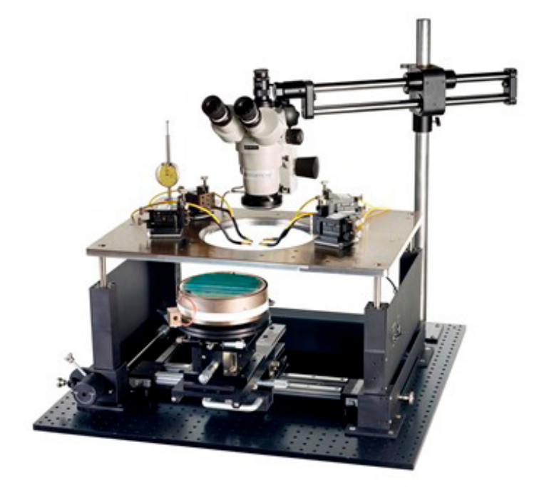
M4 configured above with a 100 mm triaxial chuck, a microscope boom, stereozoom optics and manipulators with triaxial probe arms - several configurations available

The Probe System for Life (PS4L) family of wafer probing systems is designed based on SemiProbe's patented adaptive architecture. Unlike traditional probe systems, all foundation modules - bases, stages, chucks, microscope mounts, microscope movements, optics, manipulators and more - are interchangeable, making the PS4L the consummate solution for many different applications and budgets. This unique modular design enables customers to acquire test capabilities that precisely match their requirements. More important, as the environment or test conditions change, the PS4L can easily be field-upgraded to meet these new demands. With this design philosophy, PS4L customers realize substantial time and cost savings over traditional probe systems because they do not need to invest in a new platform when wafer size, levels of automation or test requirements change.