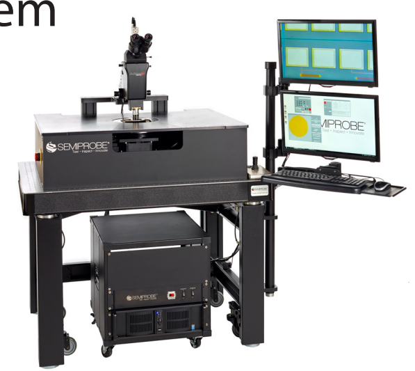
SA-12 semiautomatic probe system mounted on a vibration isolation table with an A-Zoom compound microscope and probe card holder - several configurations available.

All SemiProbe semiautomatic and fully automatic systems operate on the powerful PILOT control software suite, designed employing the same adaptive architecture philosophy as the PS4L hardware. PILOT is modular, intuitive and easy to learn. Additional control modules for added features and accessories can be implemented without changes to the core control software. Common functions such as 2 point alignment are wizard-based for easy operation - even for the occasional user. For setup or occasional users, the software can be bypassed and total control moved to a local joystick.