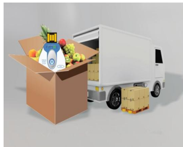
Put into the box / carton