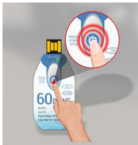
Press the button to start