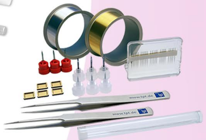
H69 Bond Starter Kit

Specifications are subject to change without prior notice