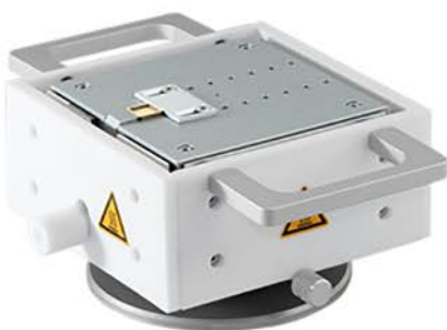
H21 Heater Stage 100 x 100mm