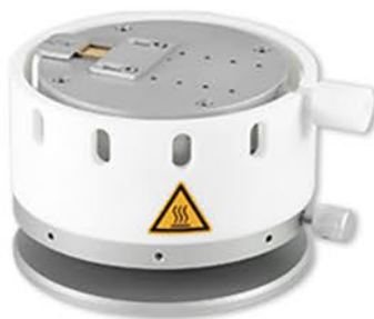
H29 90mm \varnothing Heater Stage