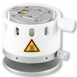
H26 60mm \varnothing Heater Stage