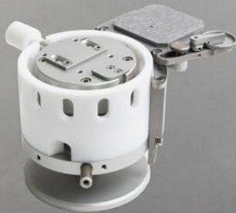
Stage with Epoxy Pot & Waffle Pack Holder

The H80 Pick & Place extension kit does not require a bond head change. Fast and easy change of bond tools lets you switch from die bonding to wire bonding and back.