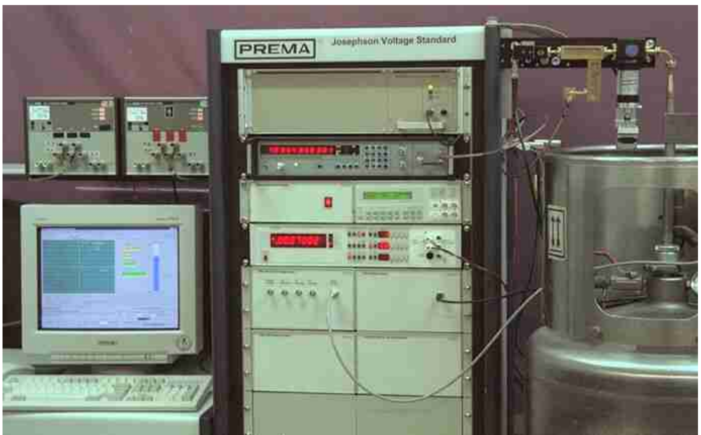
PREMA Josephson Voltage Standard JVS 7000