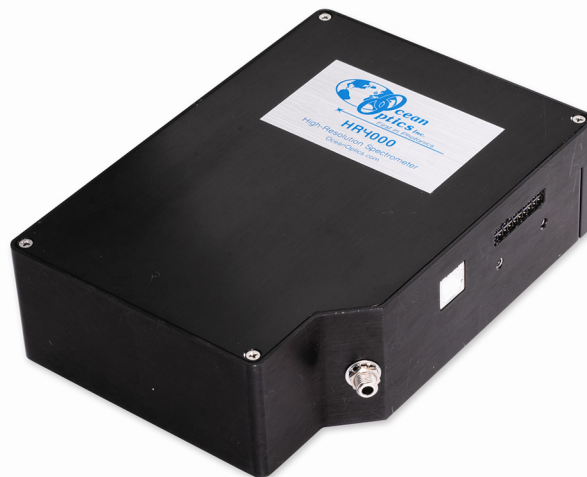
Ocean Optics HR4000 High-Resolution Fiber Optic Spectrometer

The HR4000 Spectrometer connects to a notebook or desktop computer via USB port or serial port. When connected to the USB port of a computer, the HR4000 draws power from the host computer, eliminating the need for an external power supply.