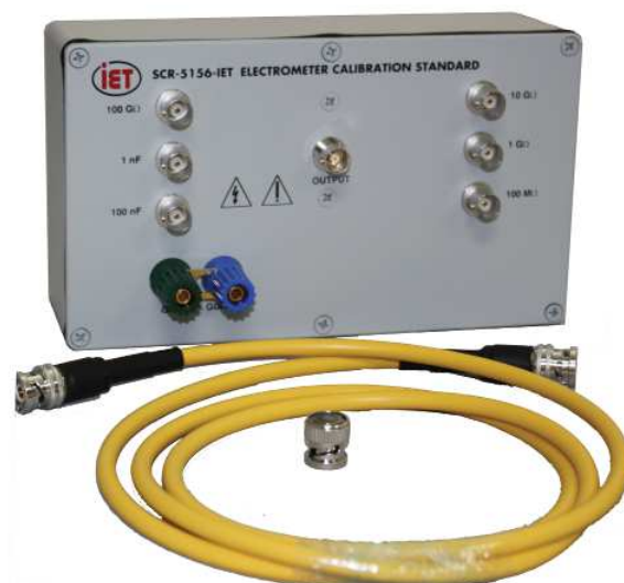
Figure 1-1: SCR-5156-IET

A ground post is electrically connected to the chassis. The ground post is provided so the chassis can be connected to earth ground for safety.