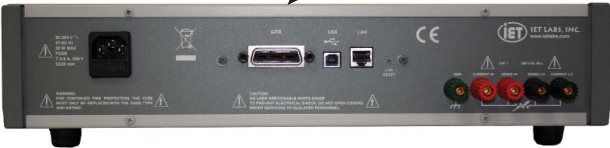
PRS-330 Rear Panel