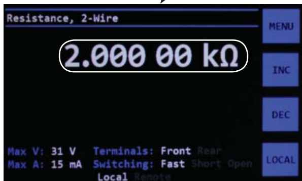
Source Resistance Screen

Touch resistance value to bring up entry screen or just enter resistance using keypad