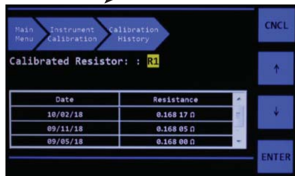
Calibration History Screen shows each calibrated resistor value and calibration date

Breadcrumbs allow easy navigation in menus