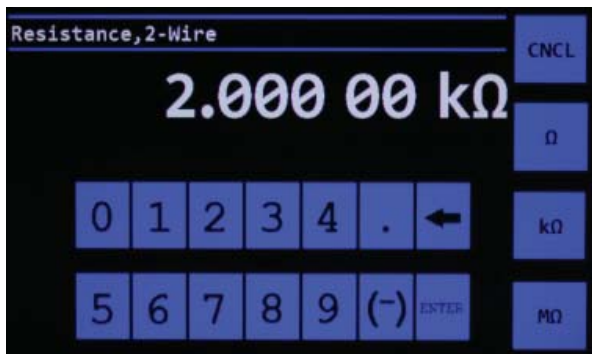
Resistance Entry Screen allows use of keypad or touchscreen to enter resistance value

See relevant setup parameters on the main screen