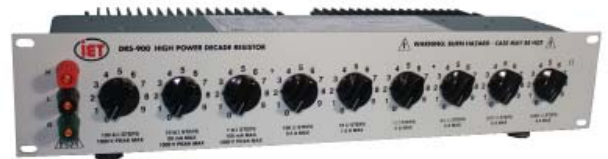
Figure 1.1 DRS-900 High-Power Decade Resistance Substituter

If continuous use is required to full rated power see DRS-900 High Power Resistance Substituter.