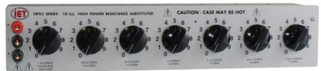
Figure 1.2 HPRS Series High-Power Decade Resistance Substituter