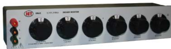
Figure 1.1. DB-62 Series High Accuracy Resistance Substituter

The DB-62 Series may be rack-mounted to serve as components in measurement and control systems.