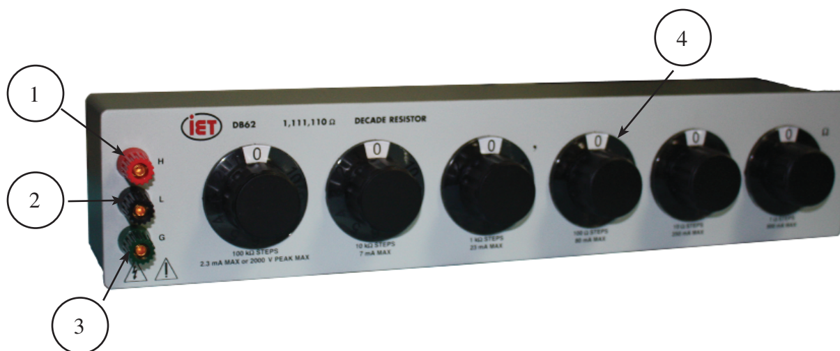
Figure 4-2. DB-62 Replaceable Parts