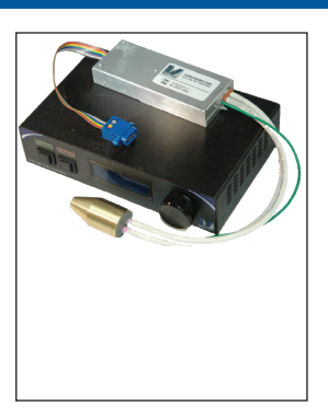
FTC-200 Tube Controller