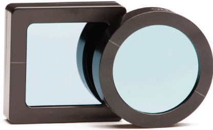
SIR Polarizer (mounting optional)