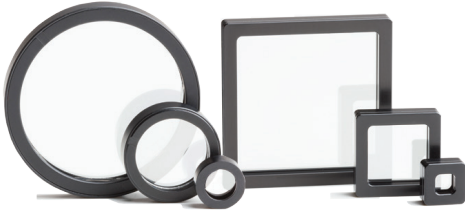
BIR Polarizers (mounting optional)