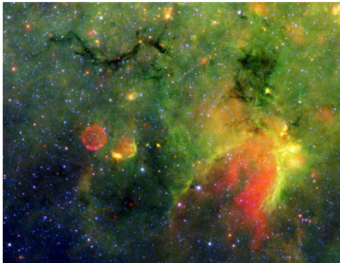
Image of Stellar Snake enabled by IR polarizer technology.

Performance data was taken from sample evaluations. Some part-to-part variation is expected.