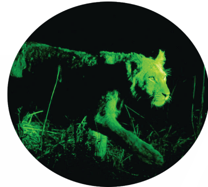
Broadband IR polarization, such as provided by Moxtek BIR04A and BIR05A, is essential in enhancing night vision and deep space imaging applications that generate stunning images.

For more detail, please use our Polarizer Comparison Tool at www.moxtek.com