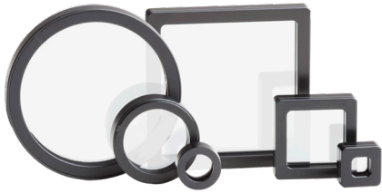
ABS Polarizers (mounting optional)