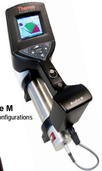
RIIDEye M multiple configurations