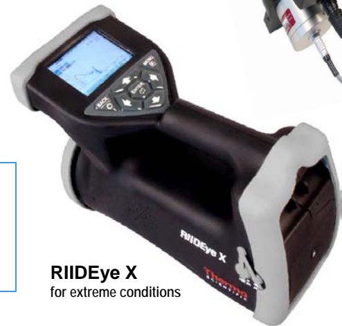
RIIDEye X for extreme conditions