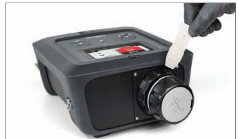
MX908 is equipped with modular accessories for ease of transition between solid and vapor sample types.