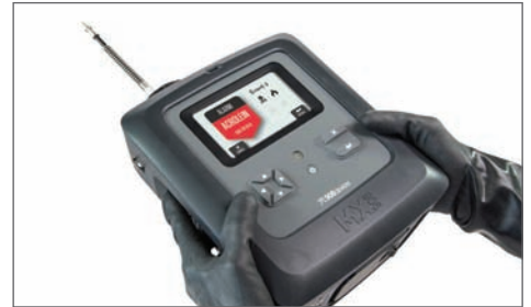
MX908 is rugged and meets the requirements for use in harsh environments.

CWA Hunter: is a mission mode for the detection of priority chemical warfare agents, including realtime vapor quantification.