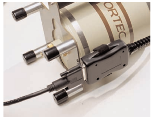
SMART-1 Detector Interface Module.

DigiDART is fully integrated with ORTEC software applications such as MAESTRO which can easily download setup parameters.