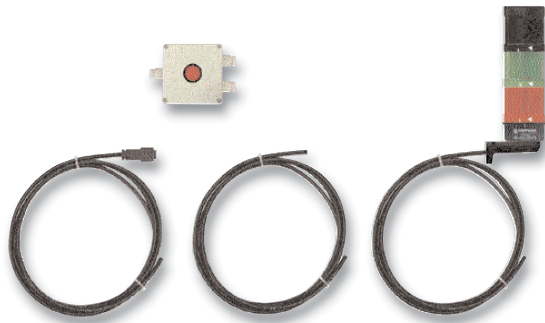
Additional alarm unit # 425068010

RadEye Area Monitor: Enclosure with transparent door; car adapter; AC/DC adapter with 2 m cable + connector; red light on enclosure; RS 232 interface 9 pin D-SUB connector (watertight); connector for external alarm unit. The Radeye has to be orderer separately.